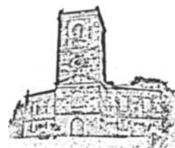
St Michael's Church